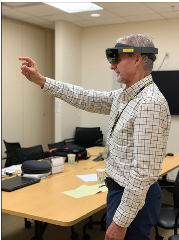
Figure 2. Image 2: Practicing directive gestures using the virtual reality trainer. 1

Multiple interventions and management options were available to the participants during the scenario. Only correct interventions, registered with the system in the correct sequence, and allowed the participant to progress through the scenario.